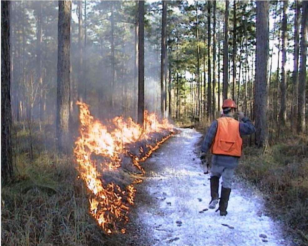
Fig. 3. Prescribed burning is essential in the longleaf ecosystem to sustain structure, function, and composition.

(Conner, 1989; Waldrop et al., 1992), and augment effects of prescribed fire in restoring longleaf ecosystems (Brockway and Outcalt, 2000). Herbicides must be used with caution or not at all in wetlands or wetland-upland ecotones, however, because little is known about their effects on reptiles and amphibians (Guyer and Bailey, 1993). Herbicides should be applied by skilled applicators who recognize important plant species to avoid unintended consequences. In addition, herbicides applied on a wide scale could result in invasion by exotics or highly competitive weed species (Clewley, 1989; Provencher et al., 1998).